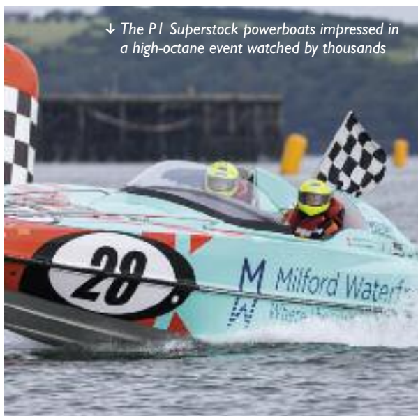
↓ The PI Superstock powerboats impressed in a high-octane event watched by thousands