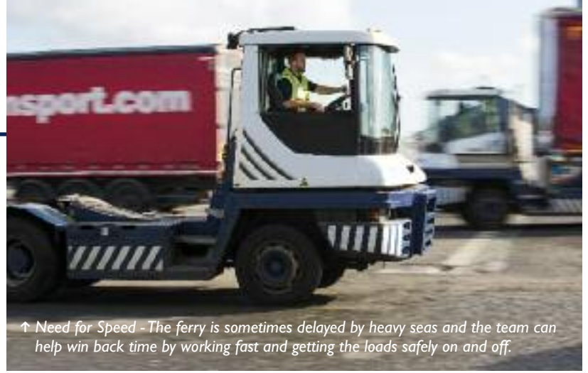
↑ Need for Speed - The ferry is sometimes delayed by heavy seas and the team can help win back time by working fast and getting the loads safely on and off.