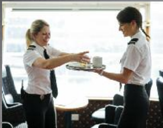
↑ First class service - the ferry boasts luxury cabins and outstanding hospitality, as well as providing a vital freight service

Luxury cabins, panoramic lounges and superb hospitality make the ship a popular part of the busy tourist trade between Celtic neighbours.