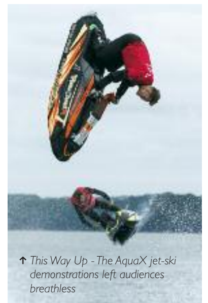
↑ This Way Up - The AquaX jet-ski demonstrations left audiences breathless