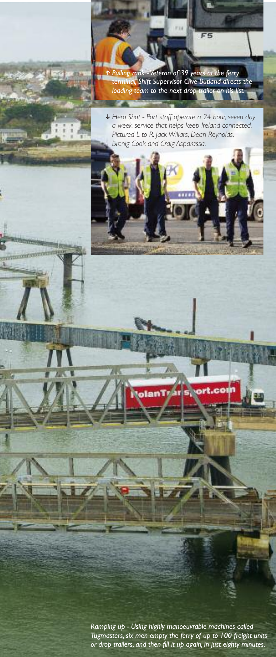
Ramping up - Using highly manoeuvrable machines called Tugmasters, six men empty the ferry of up to 100 freight units or drop trailers, and then fill it up again, in just eighty minutes.

There are few places in Wales where, in just a few minutes, you can take the pulse of another nation's economy. The expansive marshalling yard at Pembroke Dock Ferry Terminal is one such place. Here you get a pretty decent grasp of Ireland's state of economic health.