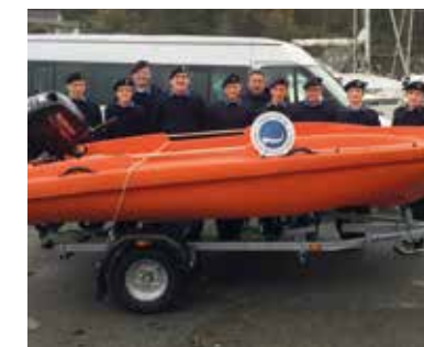
↑ Members of the Fishguard Sea Cadets with their new safety launch.

The yacht club applied to the Community Fund to purchase new navigation lights for their five longboats which are used by the rowing section in Gelliswick. The lights will ensure the boats are well lit and detectable to others on the Waterway.