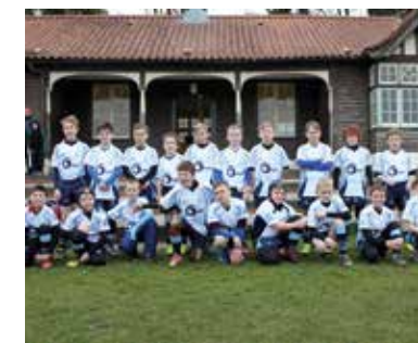
↑ Narberth RFC Under 10s

The Port provided funding for a new safety boat for Fishguard Sea Cadets. The organisation has over 70 members ranging from 10-18 years, as well as 16 adult volunteers. They offer an extensive range of activities including rowing, kayaking, power boating and windsurfing.