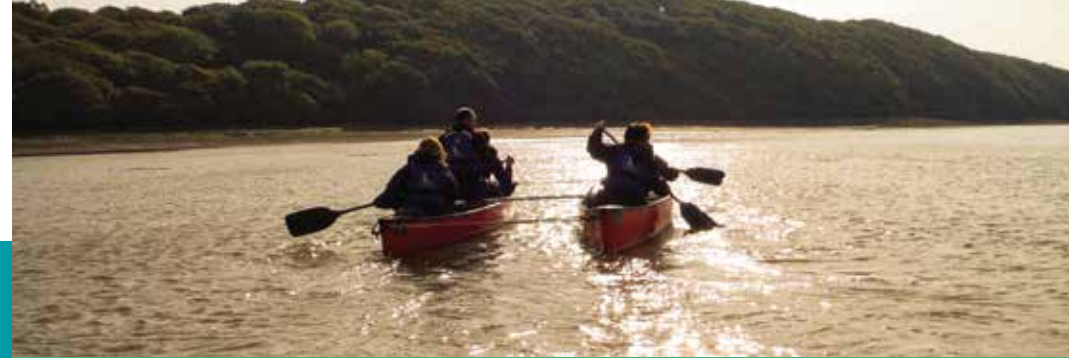
↑ Naturally calming - Canoeing or kayaking gets you close to nature and is incredibly relaxing.