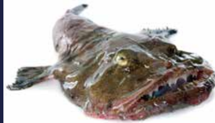
↑ Er... no thanks