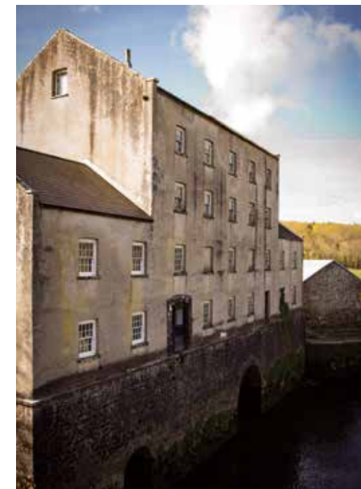
5. What is this building and what did it produce?