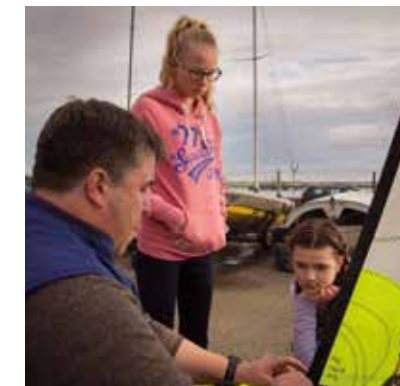
↑ Focusing on the task - sailing teaches self-discipline and good communication

Across the yard another group of children listen to their instructor as he runs through some key points. "Let's be clear on communication, ok?" he says. "On the boat, don't say 'go!' because in all the noise, it sounds like 'no!'" It would be hard to find many situations where a 12-year old was so keen to absorb tips on good communication. But sailing, and in particular dinghy sailing, matched with the friendly,