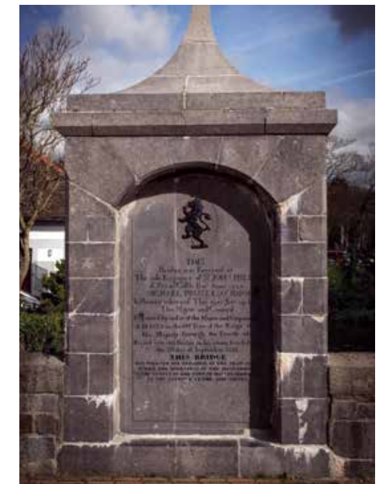
6. On which bridge will you find this and what river is it over?

The winner will receive £100 worth of vouchers to spend at a retail outlet or restaurant of their choice at Milford Marina.