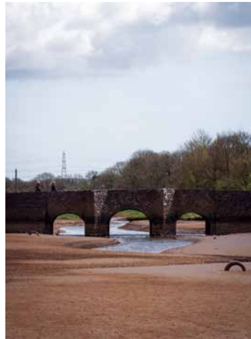
1. Where is this bridge and what body of water does it cross?

Test your knowledge of some famous landmarks up the river Cleddau. Be sure to read the questions carefully!