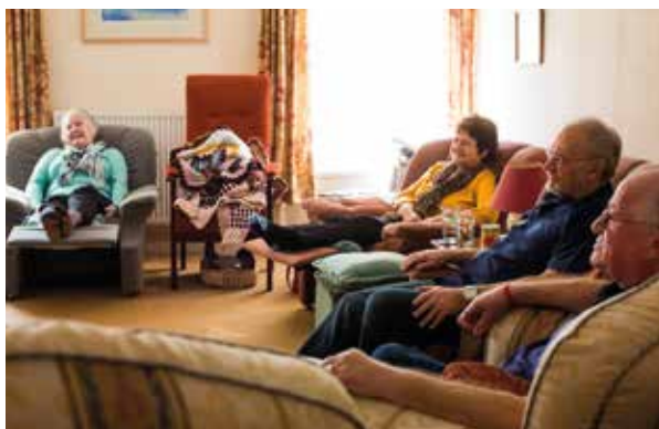
↑ Relaxation and a problem shared