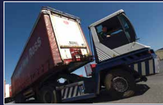
↑ Port staff work flat out to load and unload the ferry in less than two hours.

↓ Digging for victory - mega bucket to go, please.