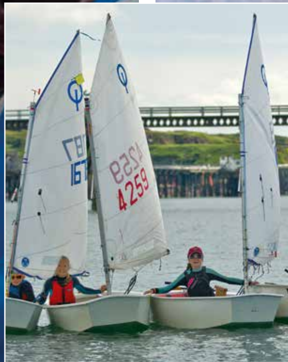
↑ Dinghy sailing is great for developing life skills

As one of the leading clubs in the county, Pembrokeshire Yacht Club is a social and leisure centre, afterschool club, talent scout and competition ground all in one.