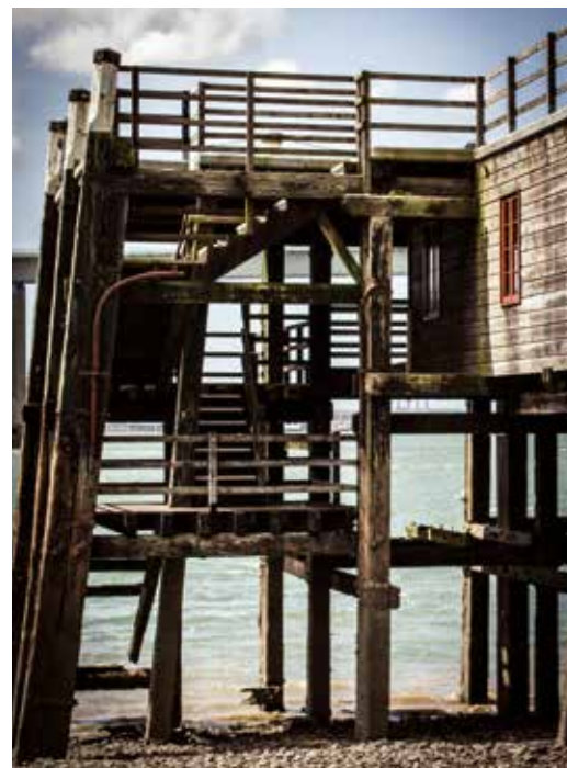
4. What is this pier called and what was it for?