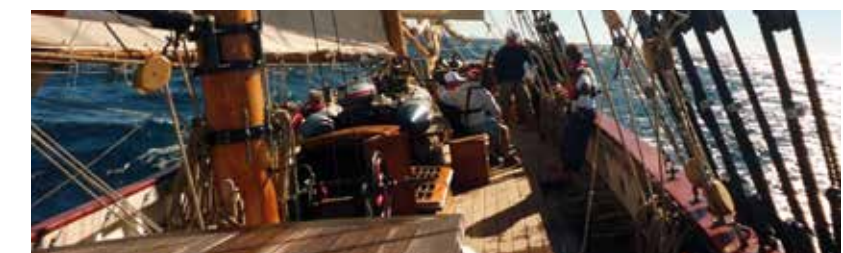
↑ There's a rare chance to crew the classic schooner, Johanna Lucretia at the biennial Seafair Haven in June.

Seafair Haven, the maritime festival that brings classic boats and sailing enthusiasts from around Europe to the Milford Haven Waterway is back this year, running from 11-18th June.