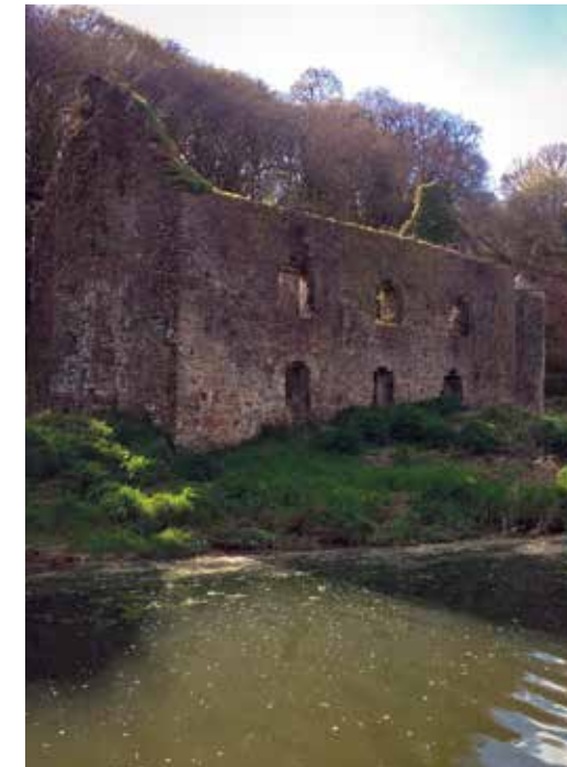
2. What is this place and which popular pub is close by?