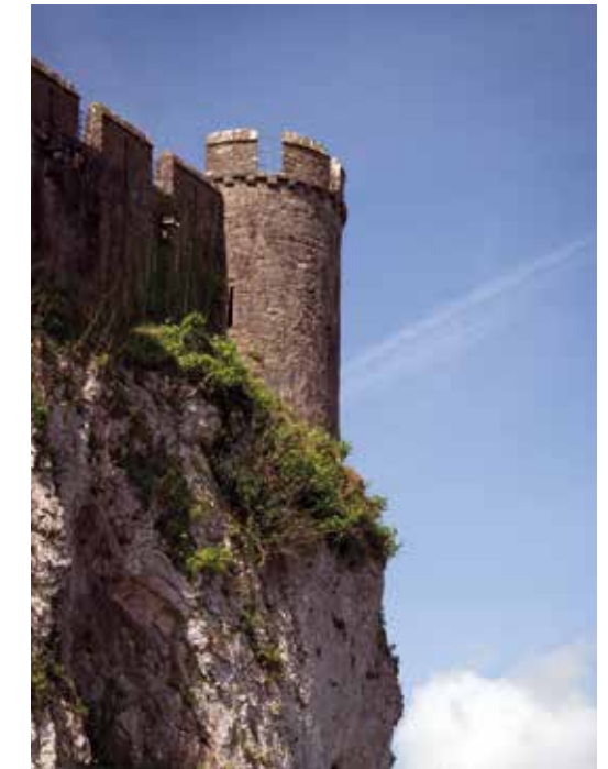
3. Where is this and who destroyed it?