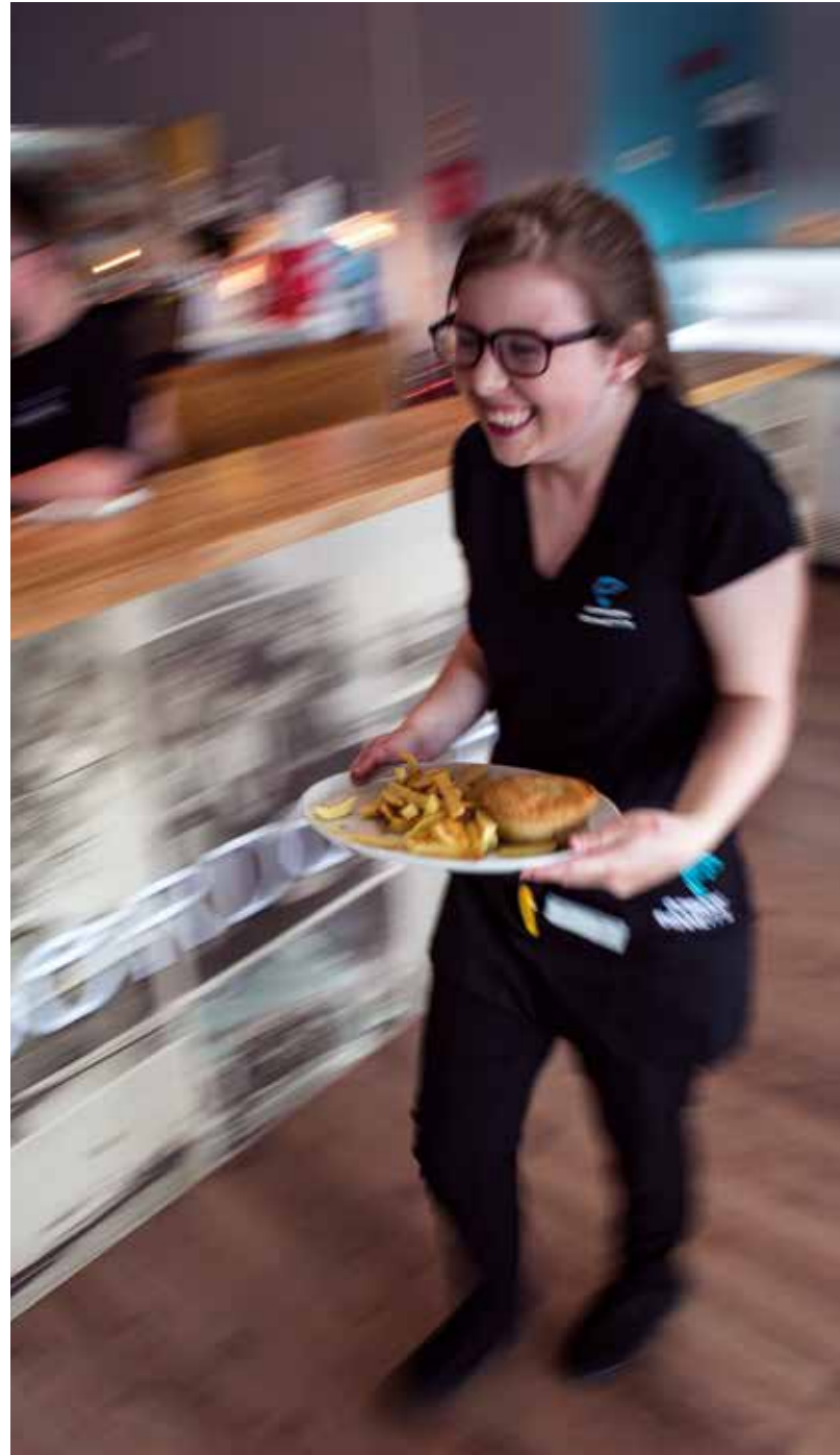
↑ Fast fish - Gordon Bennett's has been flat out since the opening.

When asked how he feels about his authoritarian role on the water, he smiles. "I try and avoid it, to keep it easy going. Ultimately though, some situations demand authority, especially when safety is an issue. However, it's much better to do it with a quiet chat." He raises his eyebrows. "Bit like being a dad really."