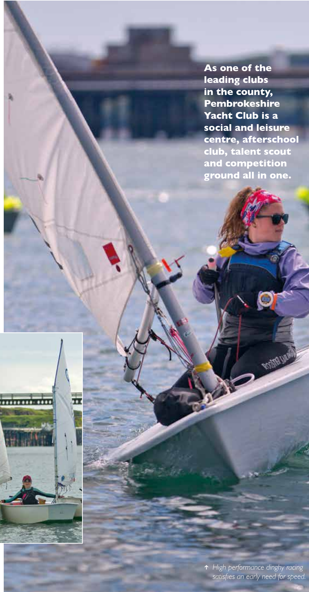
↑ High performance dinghy racing satisfies an early need for speed.

“What I love is that these kids get so much more than sailing skills when they come here. They start thinking for themselves.”