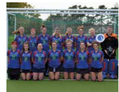
↑ The Haverfordwest Ladies Hockey Club

Narberth RFC Under 10s successfully applied for funding towards a rugby tour to Gloucester in March this year. As part of the trip they played other local teams, watched top rugby action and participated in a presentation ceremony.