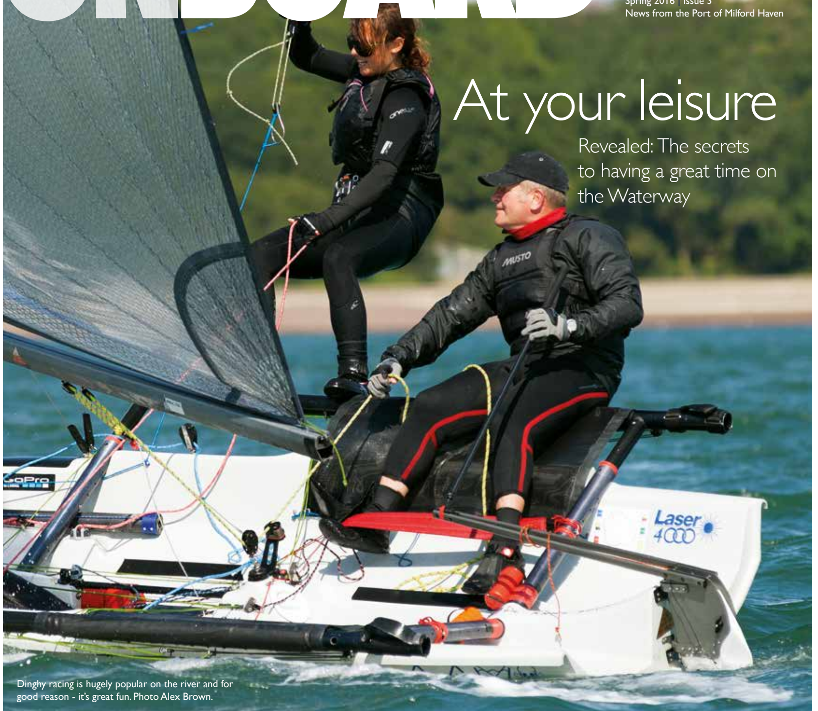
Dinghy racing is hugely popular on the river and for good reason - it's great fun.

Revealed: The secrets to having a great time on the Waterway