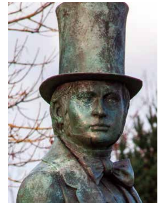
6. What is this? Where is it and where is it from?

The winner will receive £50 worth of vouchers to spend at a retail outlet or restaurant of your choice at Milford Marina.