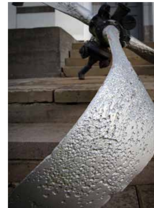
5. Where exactly is this? What is this and where is it from?