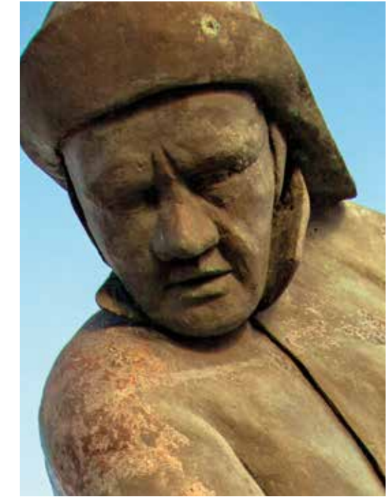
3. Where is he and what flourished because of him?