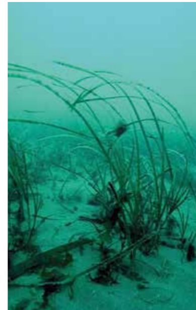
↑ Seagrass ( zostera marina ) and maerl take years to grow but can be destroyed by anchors