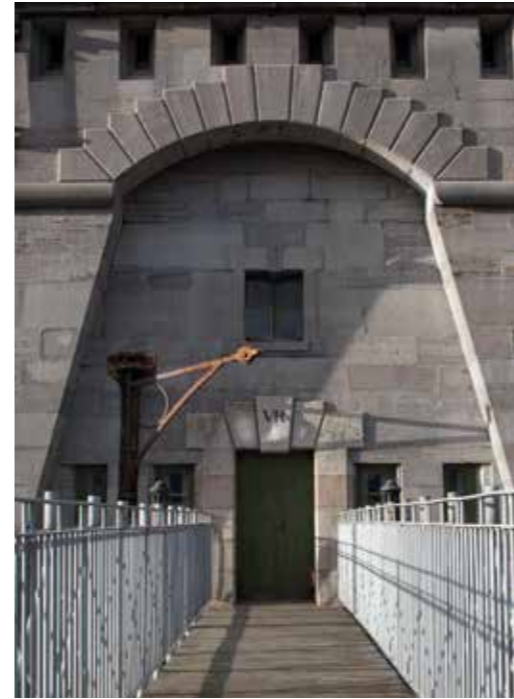
1. What is this place, where is it and when was it built?

↑ Rowing is now popular throughout the year, but as evenings draw in, boats must be visible