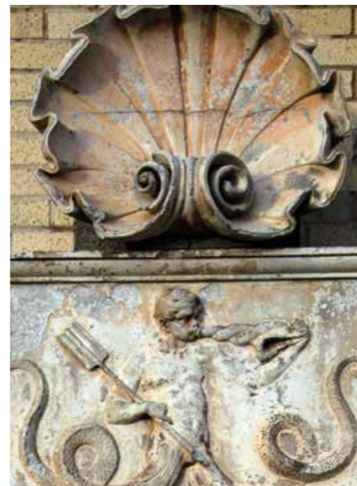
4. Where is this and whose unexpected arrival does it mark?