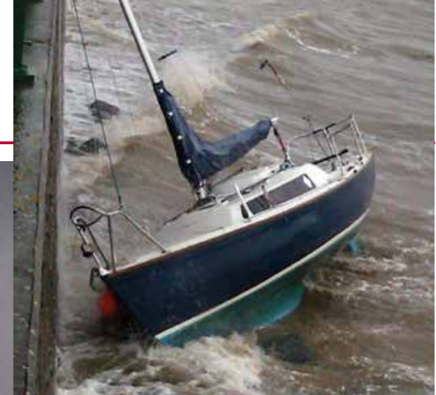
↑ On the rocks - a loose yacht can do a lot of damage to other boats and cause a major shipping hazard