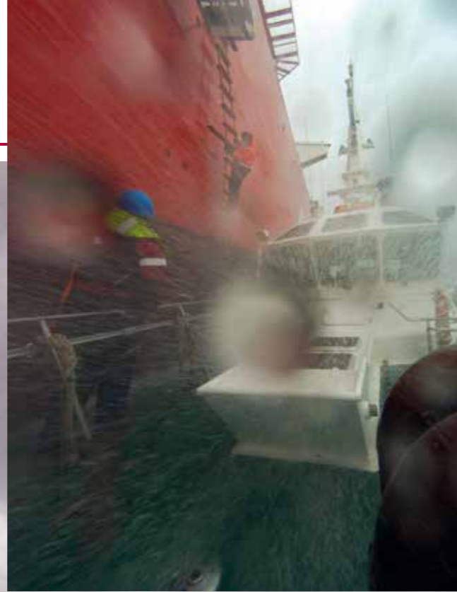
↑ Ready; get wet; GO! - The Port of Milford Haven pilot waits for a lull to make the final few metres safely down onto the Skomer

The transfer is completed and the Ingrid Knutsen steams on towards the Irish Sea while the pilot boat turns her back to the storm and runs for shelter where the crew will await their next shout.