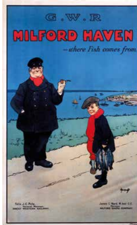
← The docks were made famous up the line in London for the high quality catch coming in from the Irish Sea.

"We built this new processing unit as part of a strategy to revitalise the industry here. We want the local economy to benefit more from fishing but to do that we need to create the demand for seafood that can be landed here," says Alaric. "Companies like Dragon Fish want to add value to seafood right here. That means investment, employment and a welcome call for local fishermen to land more of what's wanted."